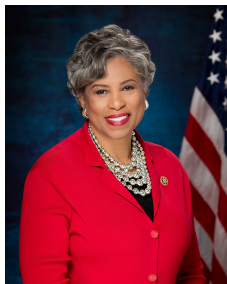
Brenda Lawrence (ret.) US House of Representatives