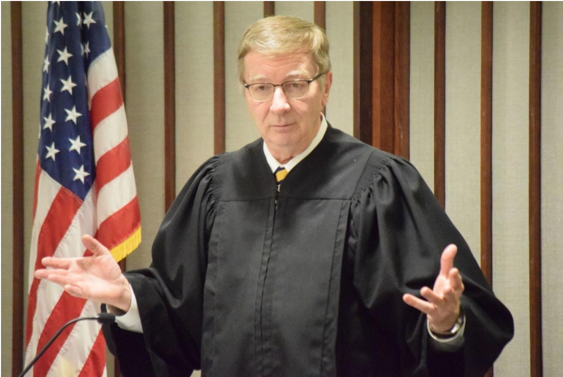
Judge Carl Marlinga of Macomb County Circuit Court